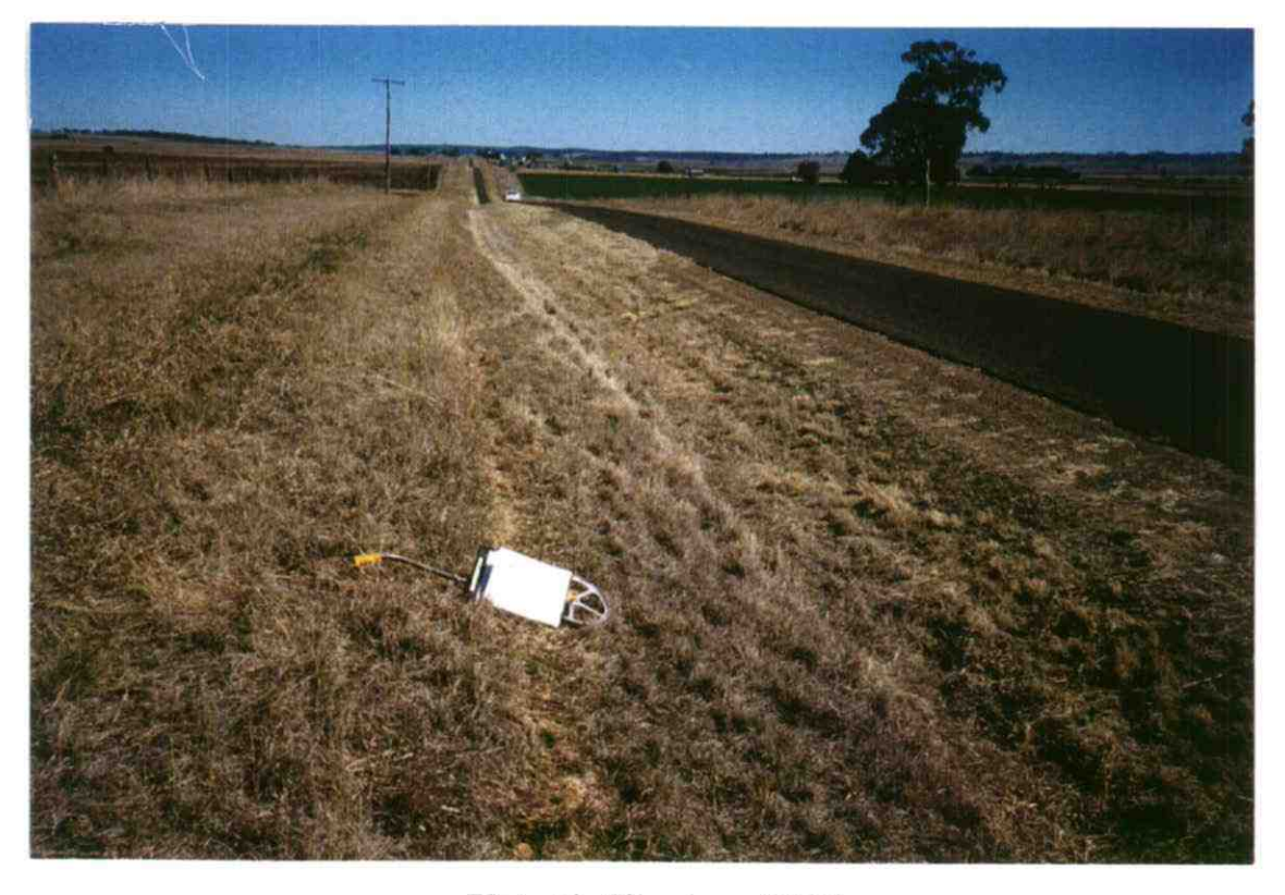
Plate 10: Site view of TP4