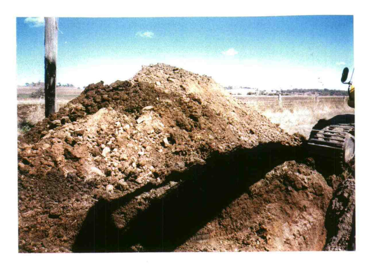
Plate 11: Excavated materials from TP4